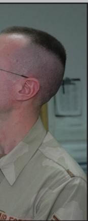
Senior Airman [Name] in flight suit deployed from [Unit].