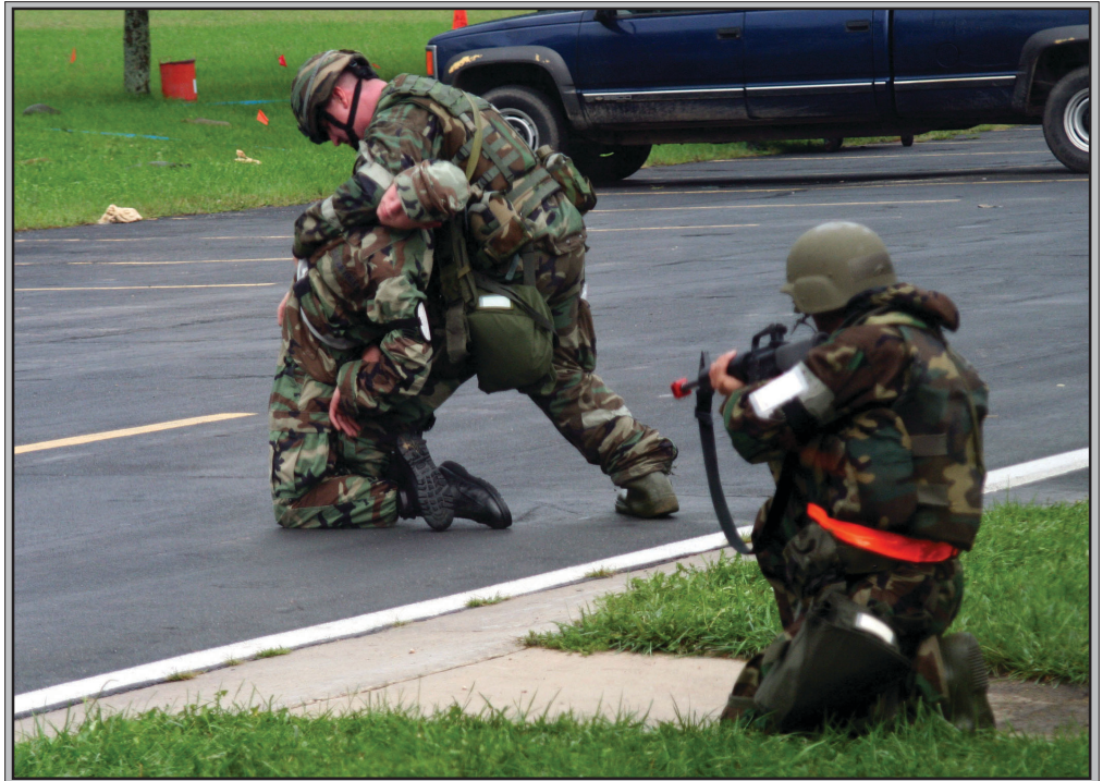
445th Airlift Wing Security Forces subdue an Airman in a scenario for Operation Readiness Safeguard at Volk Field, Wis. The wing participated in the exercise to prepare for their upcoming Operation Readiness Inspection.

The cadre along with an army of observers scrutinized the players constantly, quizzing airmen on-the-spot during scenarios and taking notes about their performance. Strengths and weaknesses were noted and all three wings will know exactly what areas they need to focus on for the Operation Readiness Inspection in February 2008 in Gulfport, Miss.