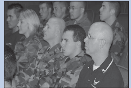
Members of the 445th Airlift Wing along with new recruits await their time to take the oath of office.