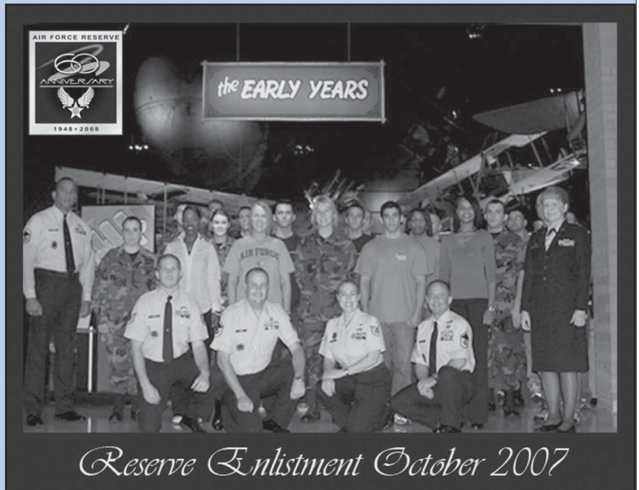
Reserve Enlistment October 2007

It was a short enlistment ceremony, but one to remember.