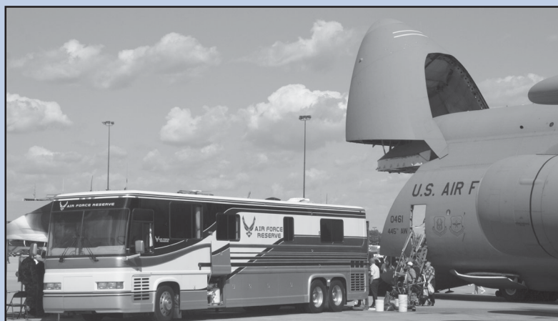
Top Left, Spectators from the Mustangs and Legends Air Show walk into the wing's C-5 Galaxy Sept. 28, 2007. Left, The Air Force Reserve Recruiting bus parks next to the wing's C-5 Galaxy at the air show.