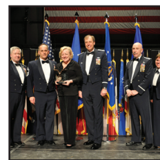
Awards banquet photo show

445TH AIRLIFT WING/PA BUILDING 4014, ROOM 113 5439 MCCORMICK AVE WRIGHT-PATTERSON AFB OHIO 45433-5132