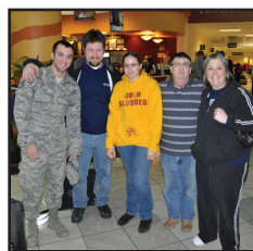
ASTS Airmen return from deployment