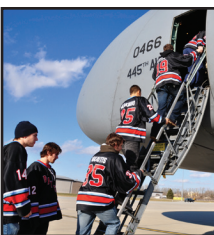
Dayton Gems tour C-5 Galaxy