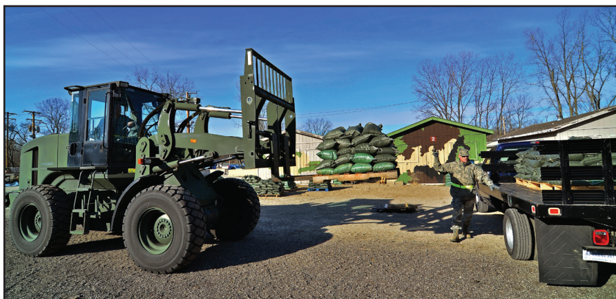
Staff Sgt. Mikhail Berlin

“A pilot may decide that they need to catch a barrier if they’re having trouble slowing down,” said Cunningham. “That’s where the folks in electrical power production come into play. They set up the barrier for the pilot. The pilot then sends down a tail hook to catch a cable on the runway and the barrier will drag out, thus slowing the plane down.”