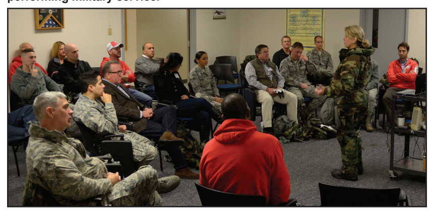
Col. Adam Willis, 445th Airlift Wing commander, gives a wing mission briefing to approximately 70 civilian employers and 35 reservists during the 445 AW Employers Day Nov. 5, 2016. The employers enjoyed breakfast and lunch, received a C-17 Globemaster III flight and participated in tours and demonstrations of the different jobs and training that their Air Force Reserve employees do when performing military service.