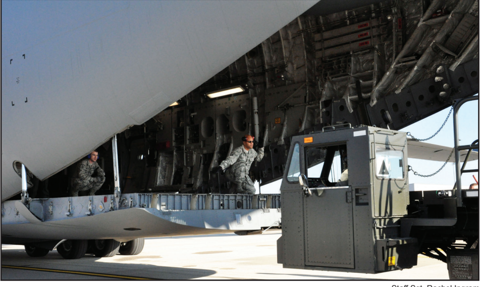
Staff Sqt. Rachel Ingram

Ramp services Port Dawgs drive large vehicles designed for transporting multiple pallets, up to 60,000 pounds of cargo, at a time. Other aerial porters work with 89th Airlift Squadron loadmasters to physically push the pallets off the aircraft so they can be taken to the aerial port cargo warehouse, where other Port Dawgs process the cargo, sometimes storing it until it can be loaded onto another aircraft and