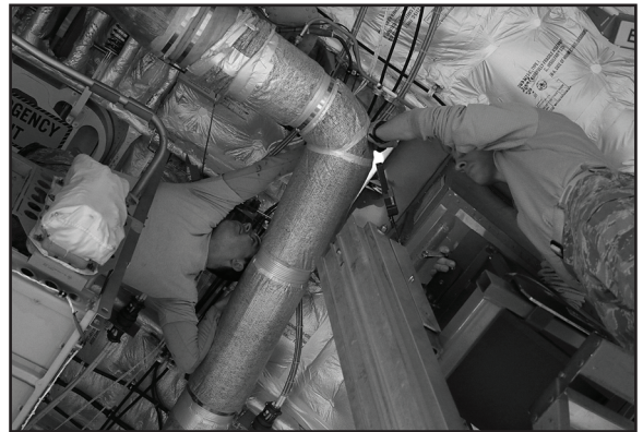
Members of the 445th Aircraft Maintenance Squadron install a life raft inside a C-17 Globemaster III Jan. 8, 2017, during the unit training assembly.