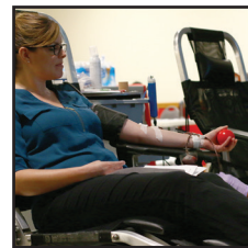
445th hosts blood drive

445TH AIRLIFT WING/PA BUILDING 4014, ROOM 113 5439 MCCORMICK AVE WRIGHT-PATTERSON AFB OHIO 45433-5132