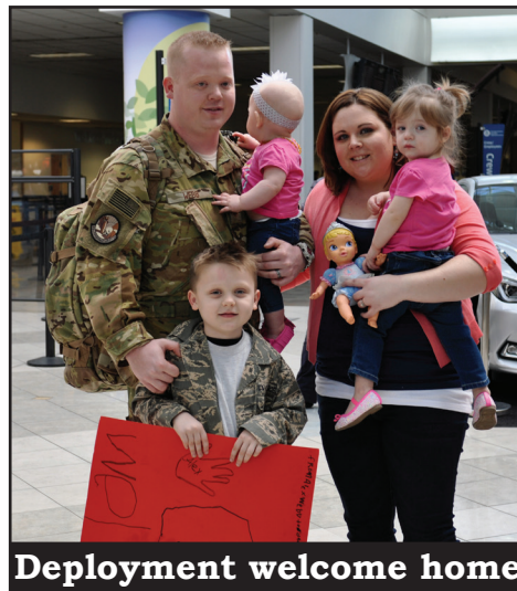
Deployment welcome home