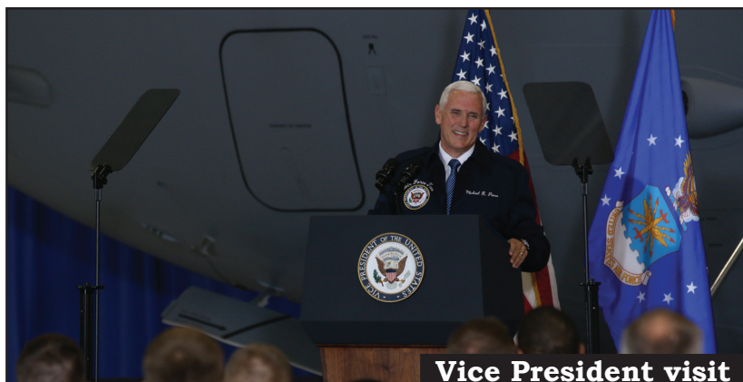
Vice President visit