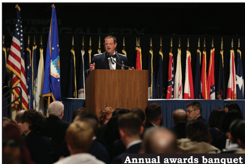
Annual awards banquet