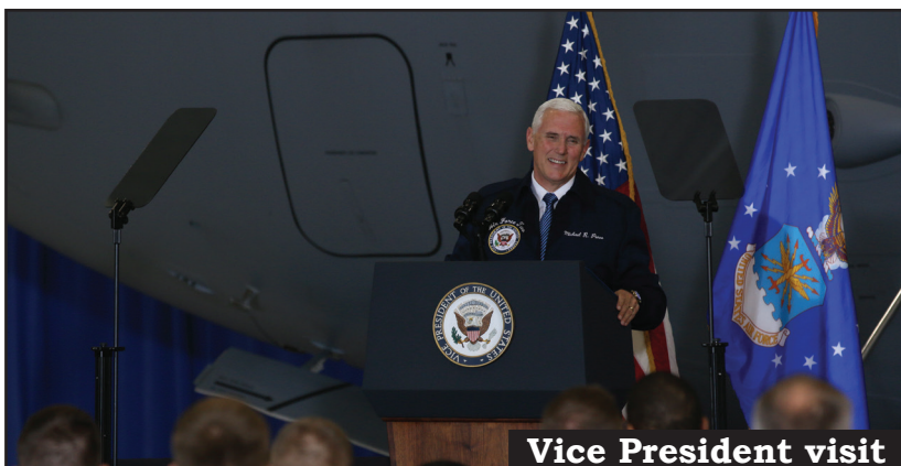
Vice President visit