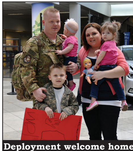
Deployment welcome home